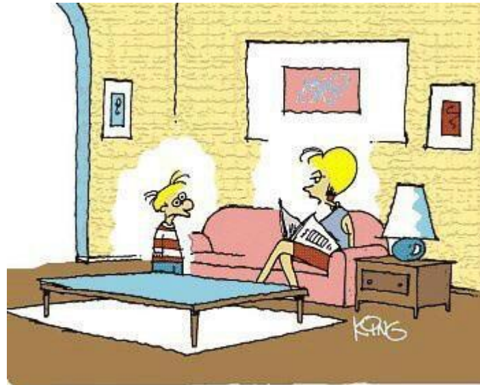
"No, you weren't downloaded. You were born."

Childhood confusion in a digital age! #edtech #digikids #edchatie #edchat #digilit http://t.co/fHKeIthxJ5