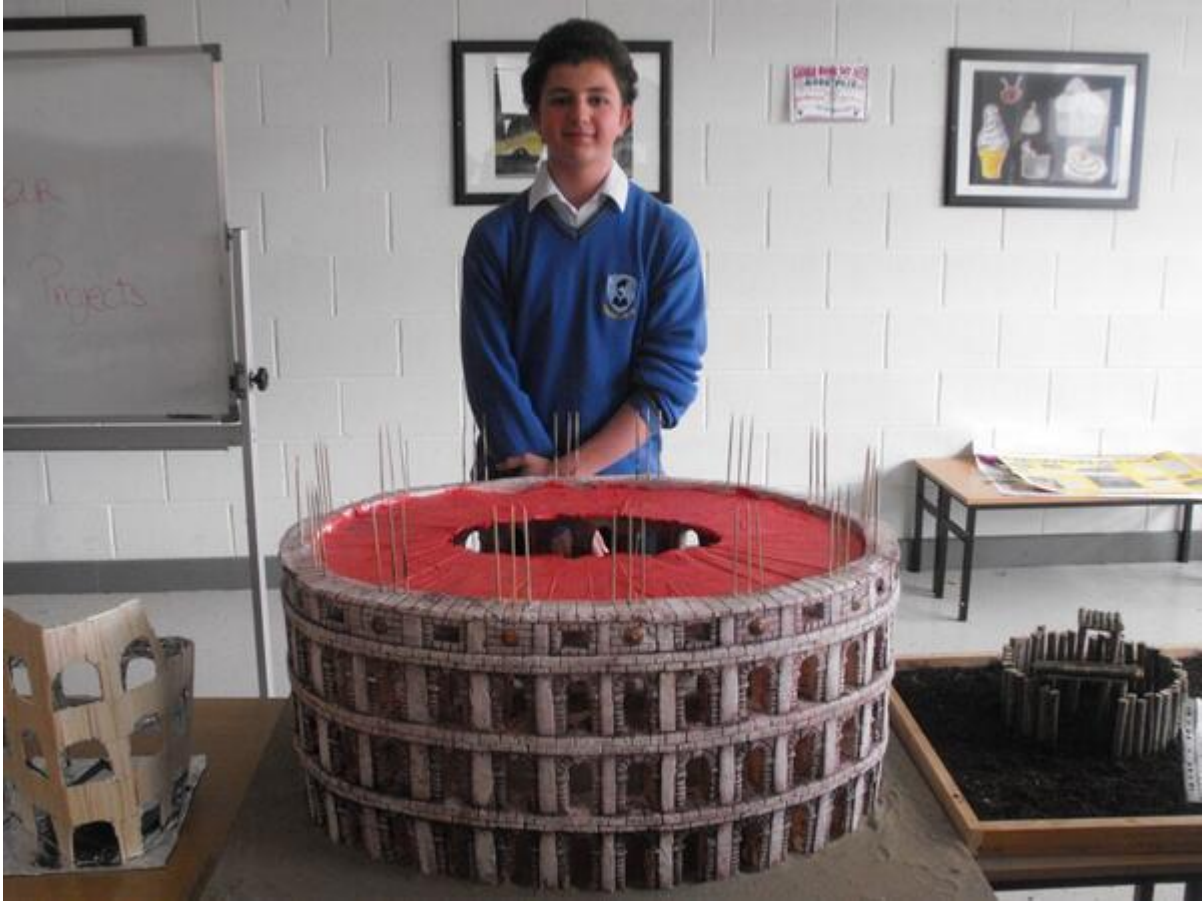
k_duffy5 1 day ago